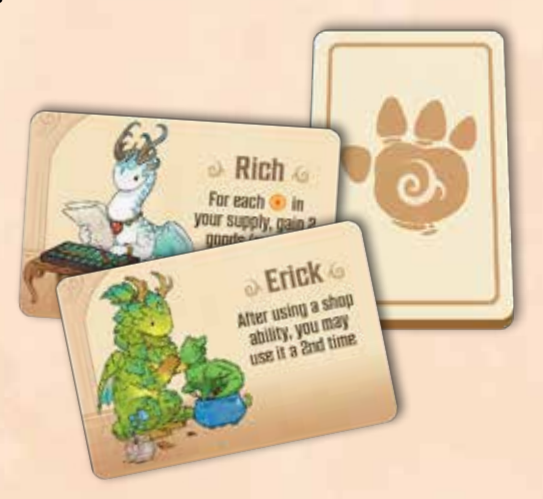
7 COMPANION CARDS