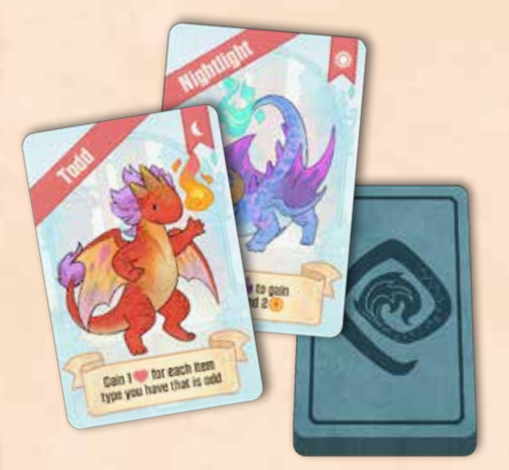
36 FANCY DRAGON CARDS