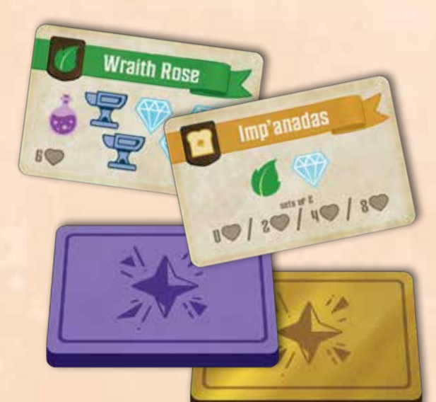
36 ENCHANTMENT CARDS (IN 2 DECKS)